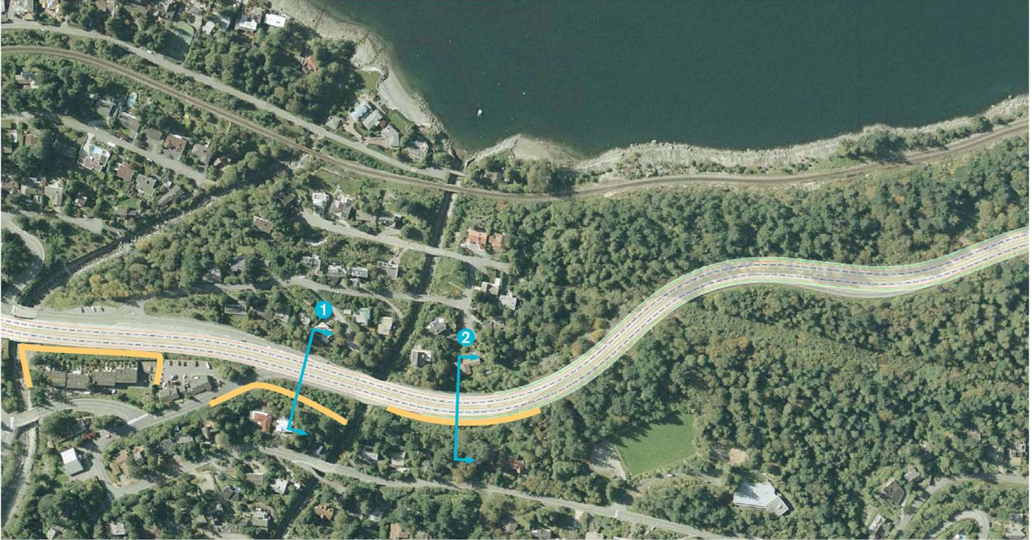
Noise Wall Off-Highway Near Home